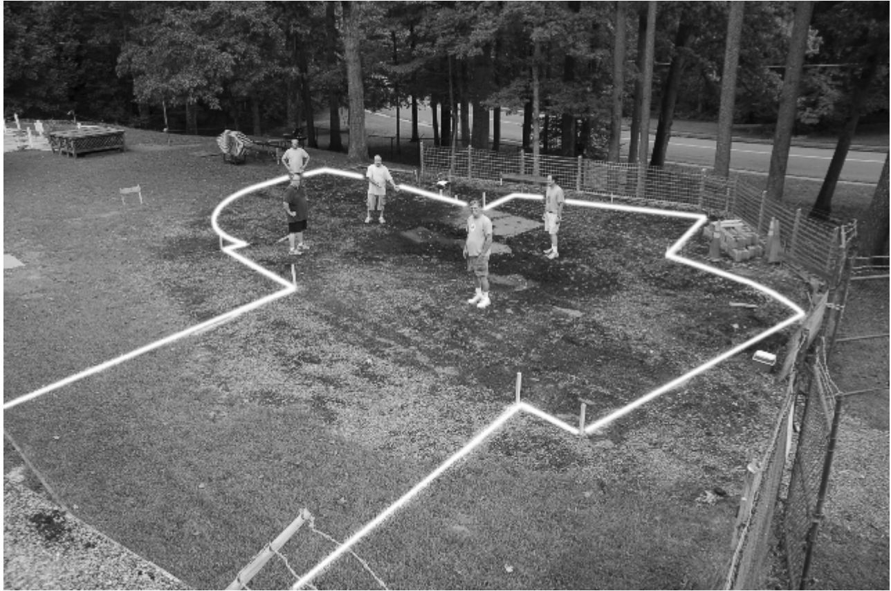
(above) Work on the pavilion at Ilda Pool has continued into the fall with more to be done over the next several weeks. The white line represents the footprint of the pavilion.